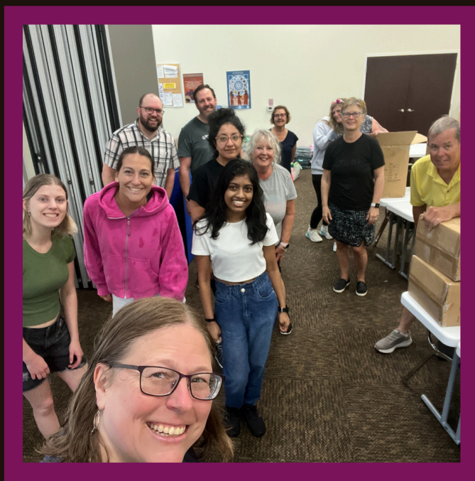
Our volunteer Managing Director & Board Chair won the 2024 Women in Business Award for Community Impact